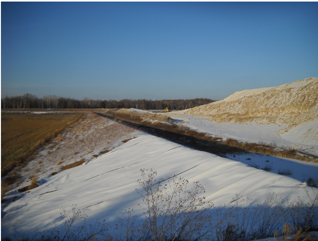
Photo 2 - Along cell 2-3 intercell berm.