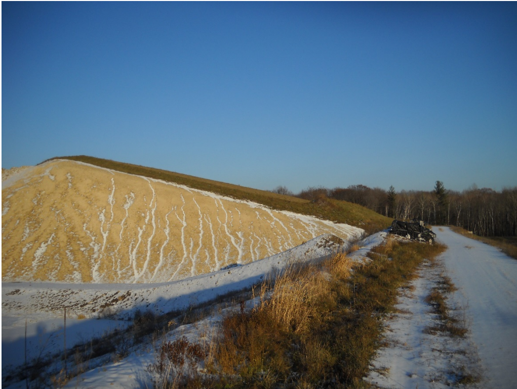
Photo 3 – Along south perimeter berm near Leachate Extraction Vault P2B.