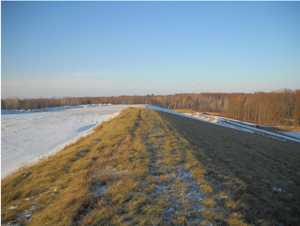
Photo 7 - Along top of Cell 2 partial final cover.