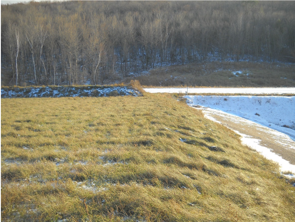
Photo 4 – Looking at the south perimeter slope from the top of the final cover.