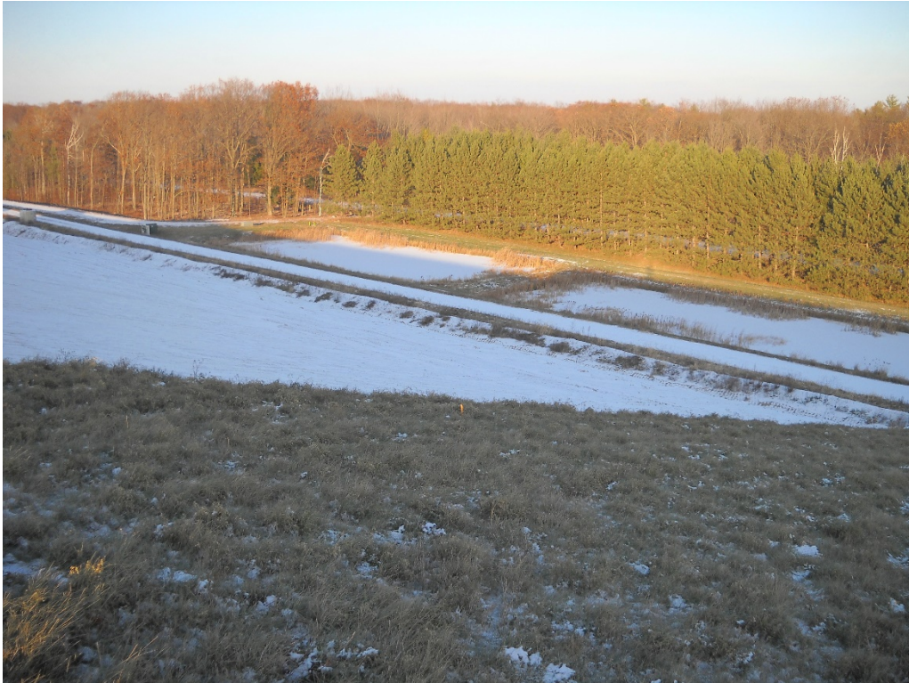
Photo 8 – From top of Cell 2 partial final cover at Stormwater Basin 2.