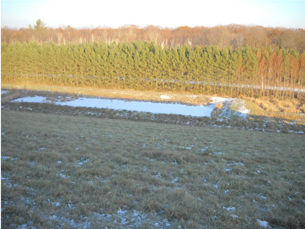
Photo 6 - From top of Cell 2 partial final cover at Stormwater Basin 2.