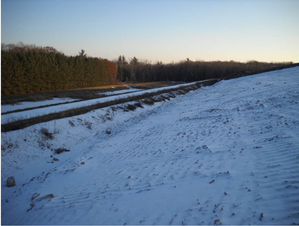
Photo 11 - Looking south to the east showing stormwater control ditch.