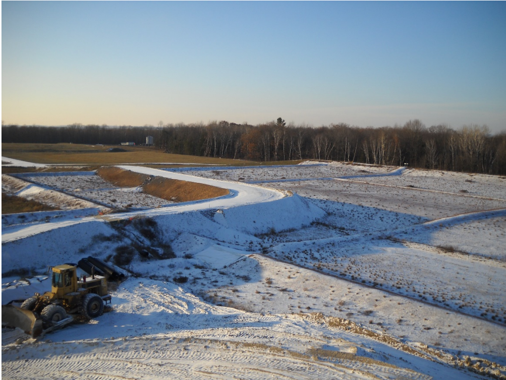
Photo 10 - Looking at ash slope in Cell 2 towards Cell 1