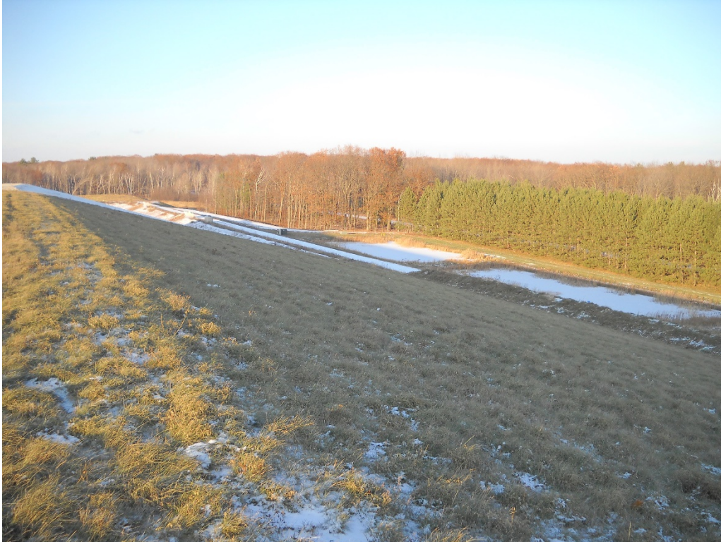
Photo 5 - From top of Cell 2 partial final cover at Stormwater Basin 2 and Stormwater Basin 3