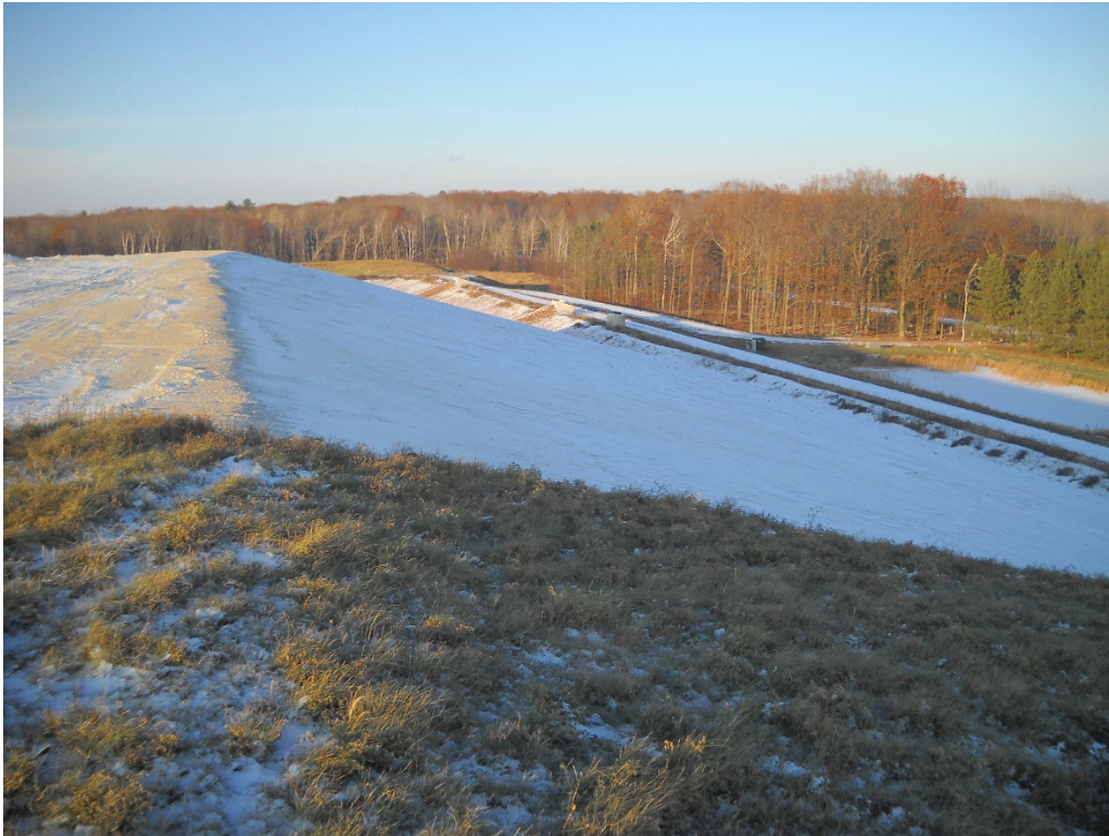
Photo 9 - Looking at ash slope in Cell 2 towards Cell 1