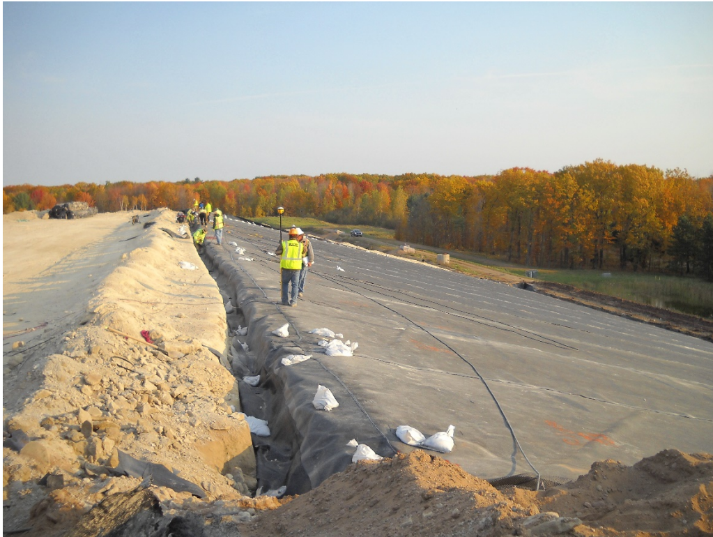
Photo 9 - Looking at covered east slope in Cell 2 towards Cell 1.