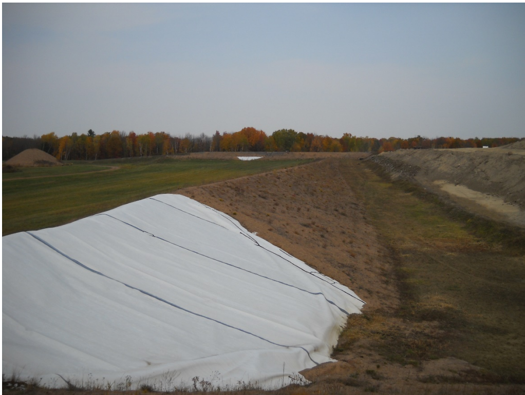
Photo 2 - Along cell 2-3 intercell berm.