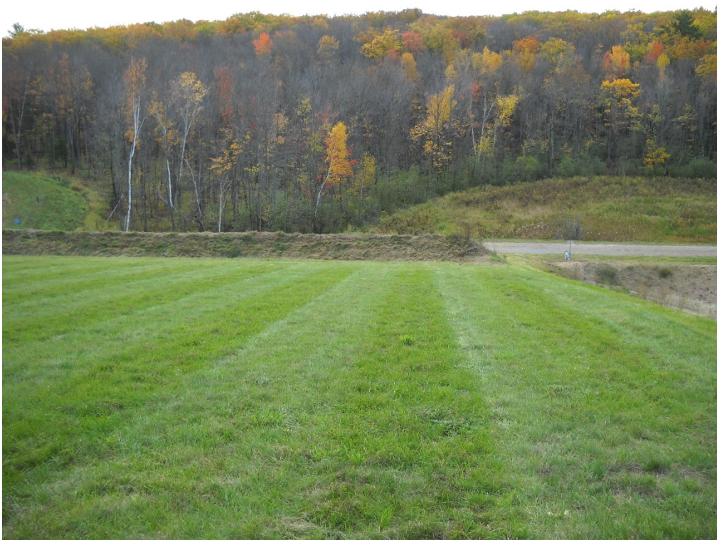
Photo 4 – Looking at the south perimeter slope from the top of the final cover.