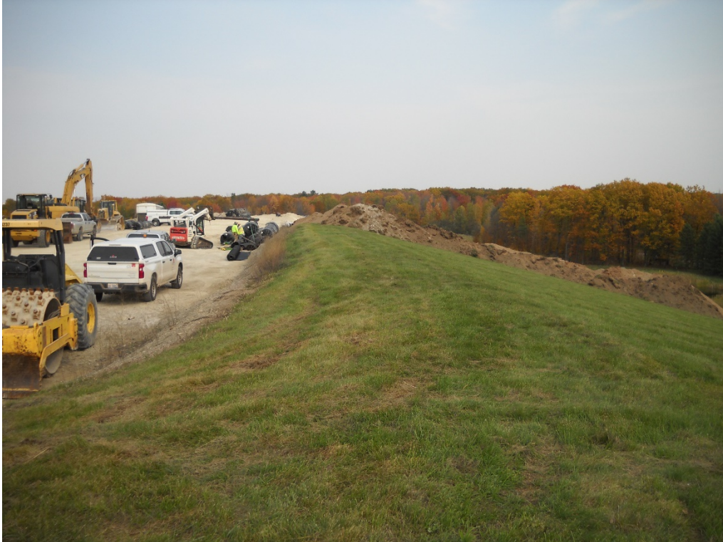
Photo 7 - Along top of Cell 2 partial final cover. Final cover activities ongoing.