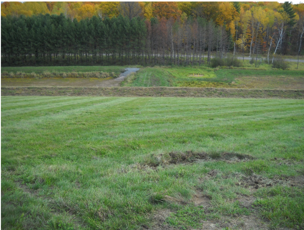
Photo 6 - From top of Cell 2 partial final cover at Stormwater Basin 2.