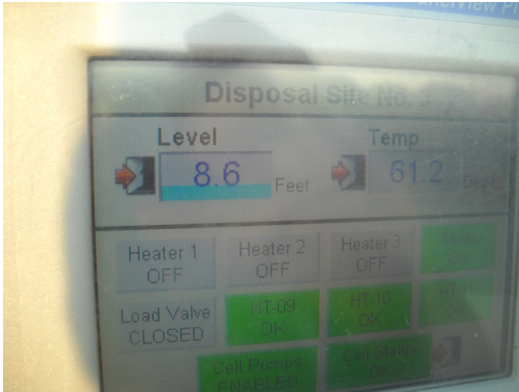
Photo 13 – Leachate collection tank readout showing 8.6 feet of leachate.