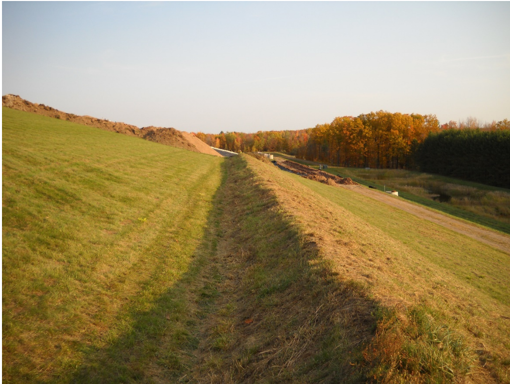
Photo 11 - Looking north to the west showing stormwater control ditch.