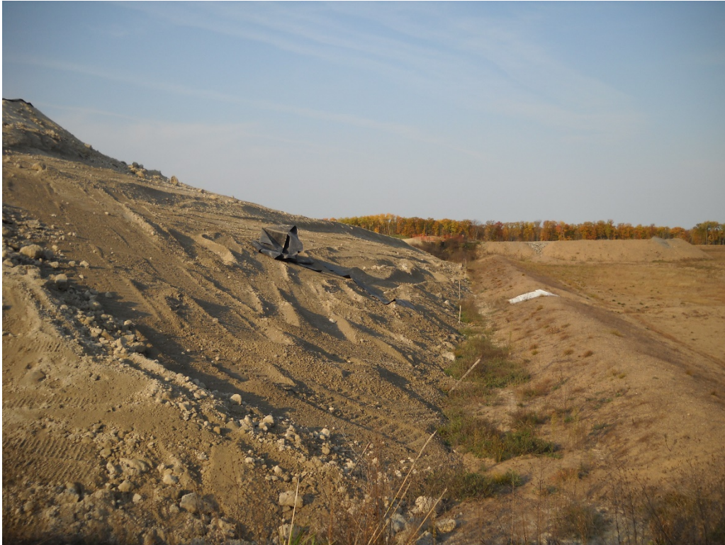
Photo 10 - Looking at north ash slope in Cell 2.