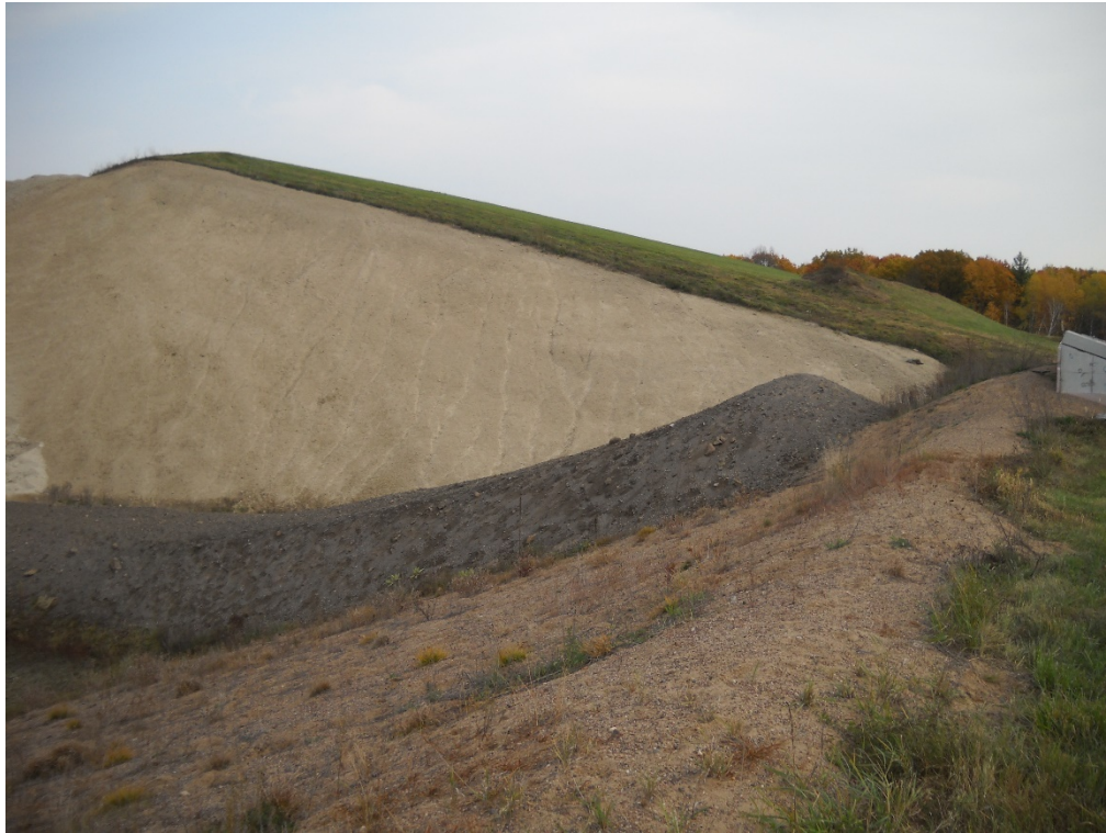
Photo 3 – Along south perimeter berm near Leachate Extraction Vault P2B.