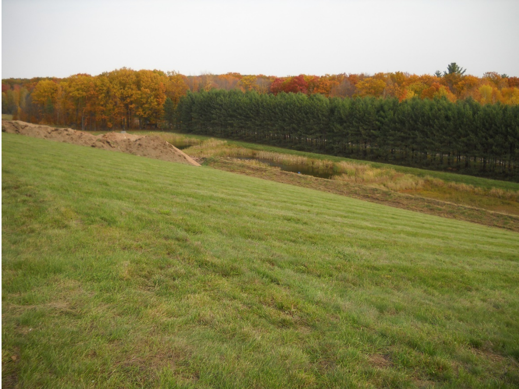
Photo 5 - From top of Cell 2 partial final cover at Stormwater Basin 2 and Stormwater Basin 3.